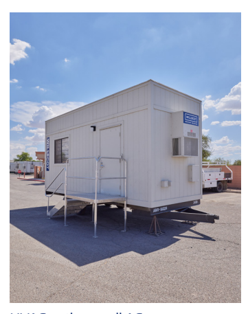
HVAC or thru-wall AC

Perfectly suited for job sites where space is limited, our small 8' wide mobile office trailers provide up to 288 sq ft of working space, with multiple configurations for whatever you need; private offices, restrooms, meetings, and more. (Up to 36' length)