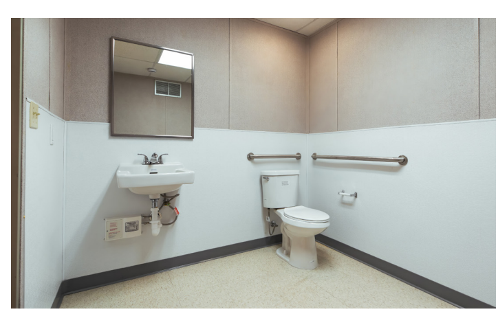
In-unit restrooms available