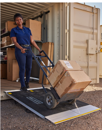
Storage combo available

Our container office is perfect for informal team meetings, dedicated workstations, breakrooms with café space, and more