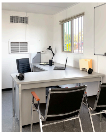
Full range of furnishings available

Our open bay GLO plus format is perfect for team meetings, dedicated workstations, breakrooms with café space, and more.